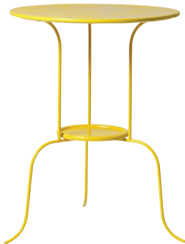
Cheryl gave this metal table a splash of bright colour with Rust-Oleum Mode Spray Paint in Sunflower.

www.allroundcreativejunkie.com @cheryl_lumley