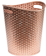
Waste basket sprayed with Rust-Oleum Metallic in Bright Copper.