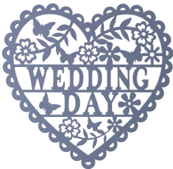
Metal sign sprayed with Rust-Oleum Painter's Touch in French Lilac.