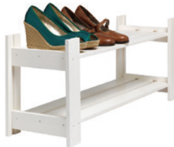
Shoe rack sprayed with Rust-Oleum Painter's Touch in Satin White.