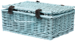
Wicker picnic basket sprayed with Rust-Oleum Mode in Celeste.