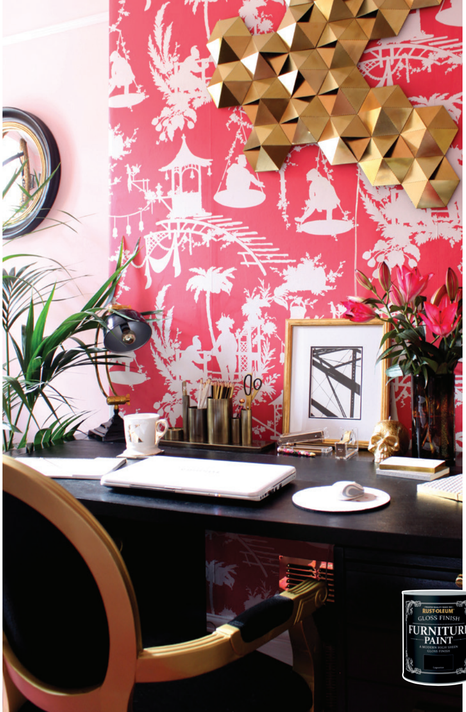
Desk painted in Rust-Oleum Gloss Finish Furniture Paint in Black. Chair painted in Rust-Oleum Metallic Finish Furniture Paint in Gold.