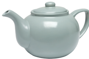
Teapot sprayed with Rust-Oleum Painter's Touch in Winter Grey.