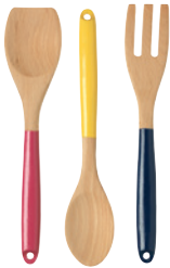
Utensils sprayed with Rust-Oleum Painter's Touch in Berry Pink, Sun Yellow and Deep Blue.