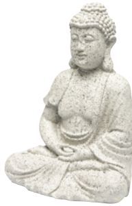
Buddha ornament sprayed with Rust-Oleum Textured, Pebble Finish.