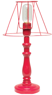
Lamp pedestal and frame s sprayed with Rust-Oleum Mode in Hot Pink.