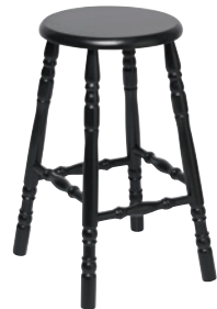
Stool sprayed with Rust-Oleum Painter's Touch in Gloss Black.